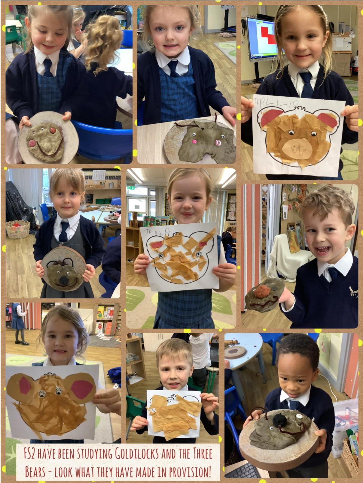
FS2 HAVE BEEN STUDYING GOLDILOCKS AND THE THREE BEARS - LOOK WHAT THEY HAVE MADE IN PROVISION!