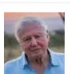
Sir David Attenborough

Read with your child at least three times a week and record this in their journals. Reading books will be changed by class teachers on a Monday. Children will take home a fully decodable reading book until their phonics knowledge is secure, this is to support your child in applying their increasing phonics knowledge and is in line with current DfE guidance.